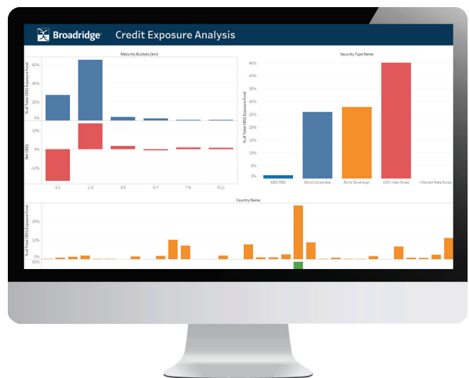
Visual Analytics: See and better understand your Investment Performance, Exposure and Market Risk Profile