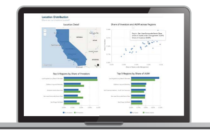
WHO ARE MY CUSTOMERS?